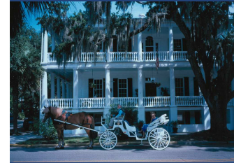
You'll feel like you've traveled back in time

Departure: Listerhill Credit Union, 4790 E 2nd St, Muscle Shoals, AL @ 8 am