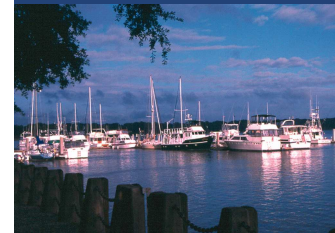
Beaufort, SC - "Queen of the Carolina Sea Islands"