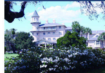
Jekyll Island - Georgia's elite coastal barrier island